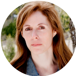
Laurie Halse Anderson